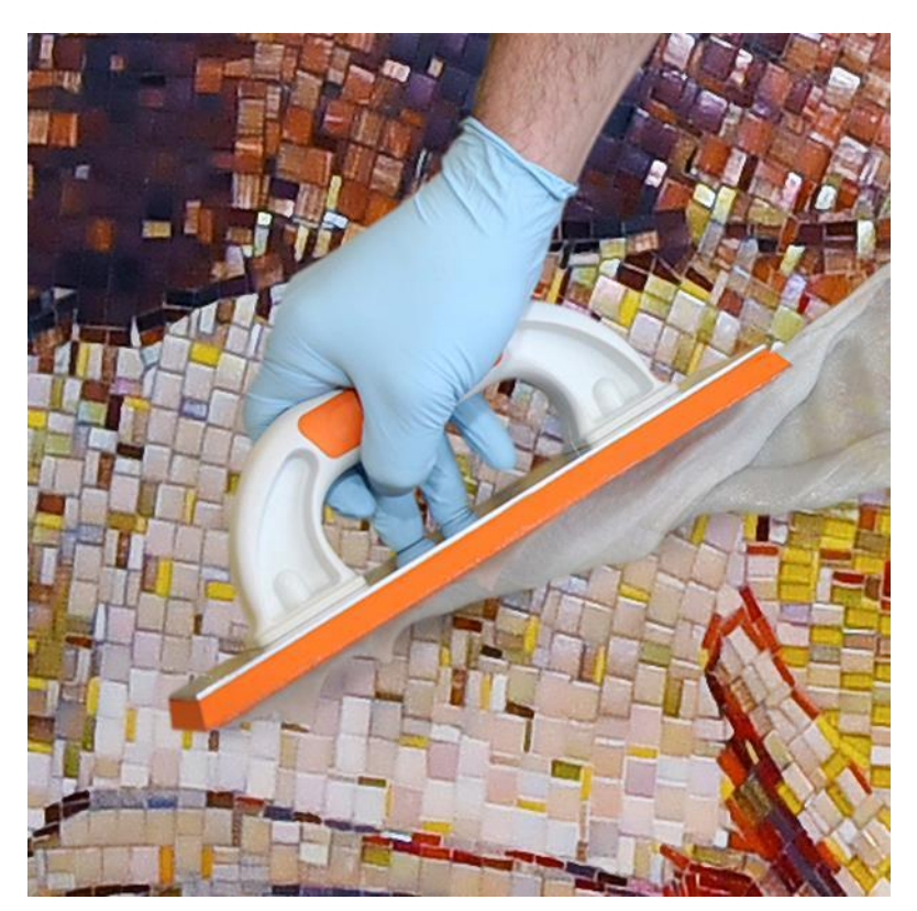
Jointing with PCI Durapox Premium Harmony (<u>Link</u> to high-resolution photo)