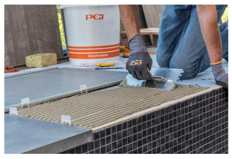
PCI Flexmörtel — Generic term for a whole product group (<u>Link</u> to high-resolution photo)