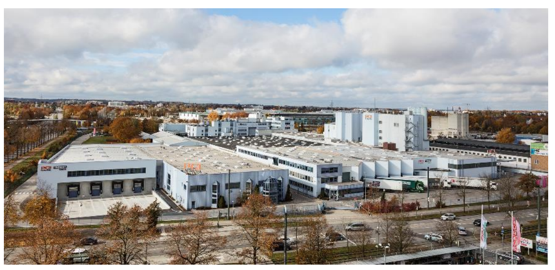
PCI-Headquarters in Augsburg (<u>Link</u> to high-resolution photo)