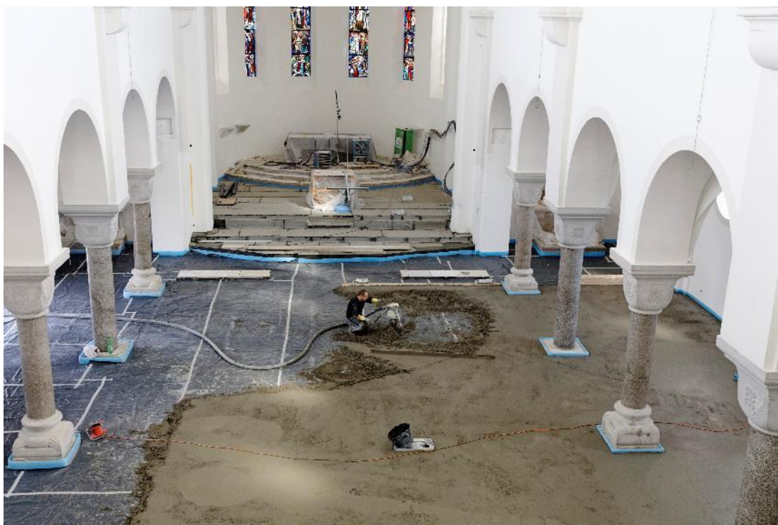
PCI system solution for screed repair: Craftspeople benefit from extremely short drying times and faster readiness for covering. ( Link to high-resolution photo )